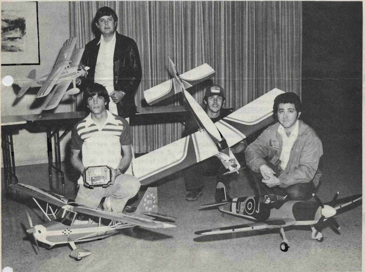
PACKARD PHOTOGRAPHY BURBANK